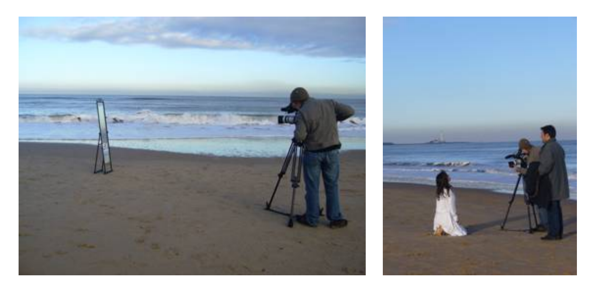
Shooting "The Equivocal Mirror" on location at Whitley Bay, Tyne and Wear.

Two independent performances, about one single story. The life, through a mirror.