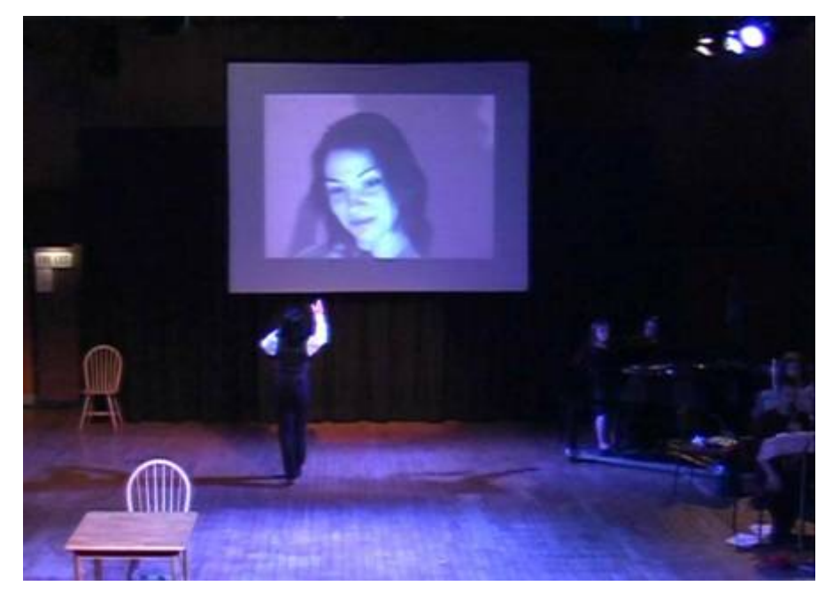
Dancers on both sides of the reality. The voyage of life on stage.