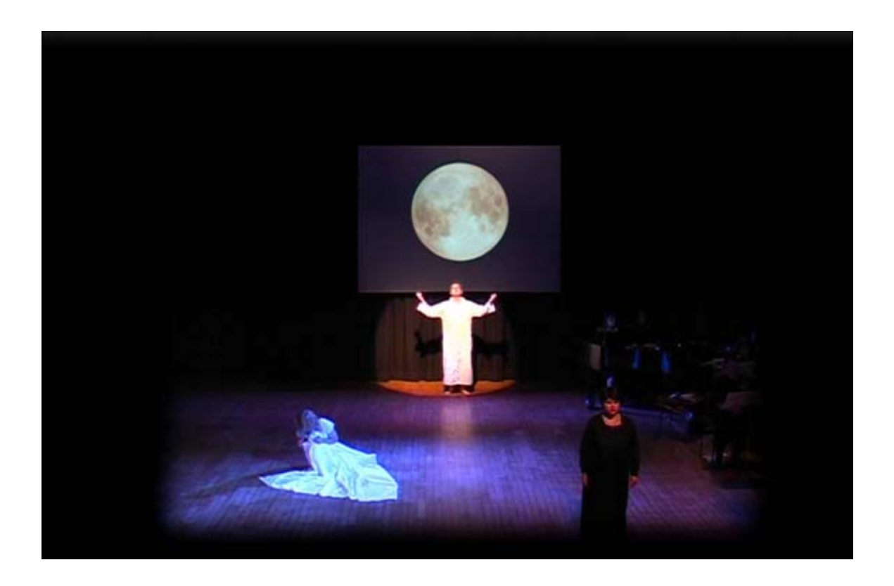
"Three Word Poem About Loss" at The Caedmon Hall, Gateshead, June 2007.