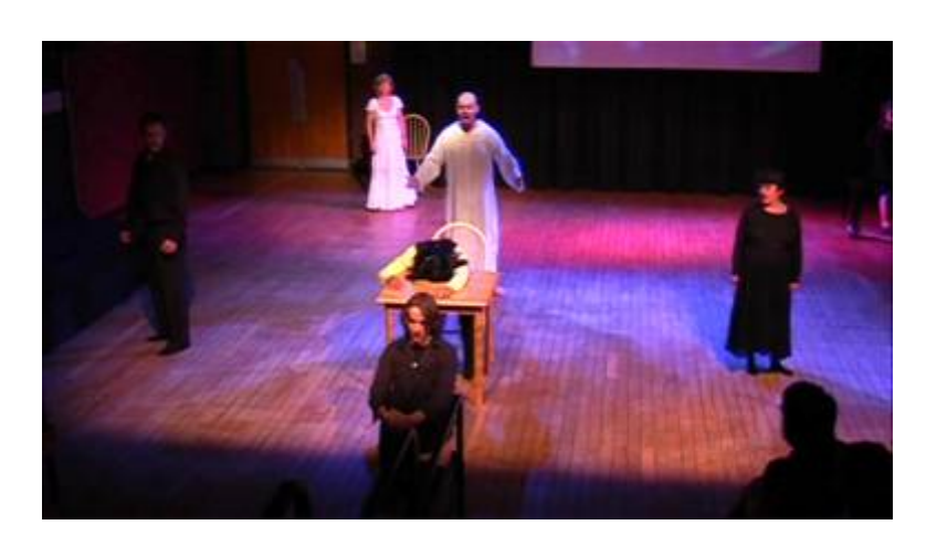
"Three Word Poem..." at The Caedmon Hall, Gateshead, June 2007.